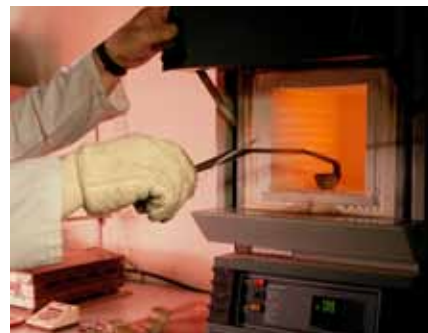
Heat treatment of metals.