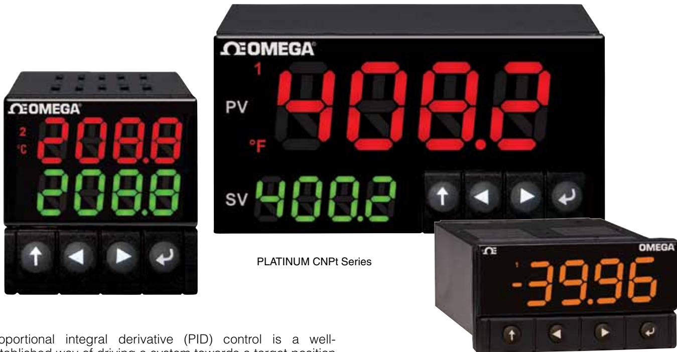
PLATINUM CNPt Series

Proportional integral derivative (PID) control is a well-established way of driving a system towards a target position or level. It's practically ubiquitous as a means of controlling temperature, and finds application in myriad chemical and scientific processes as well as automation. PID control is however not without problems. It can yield less than ideal results in situations where the target value changes, whether as a step function or as part of a "ramp & soak" profile.